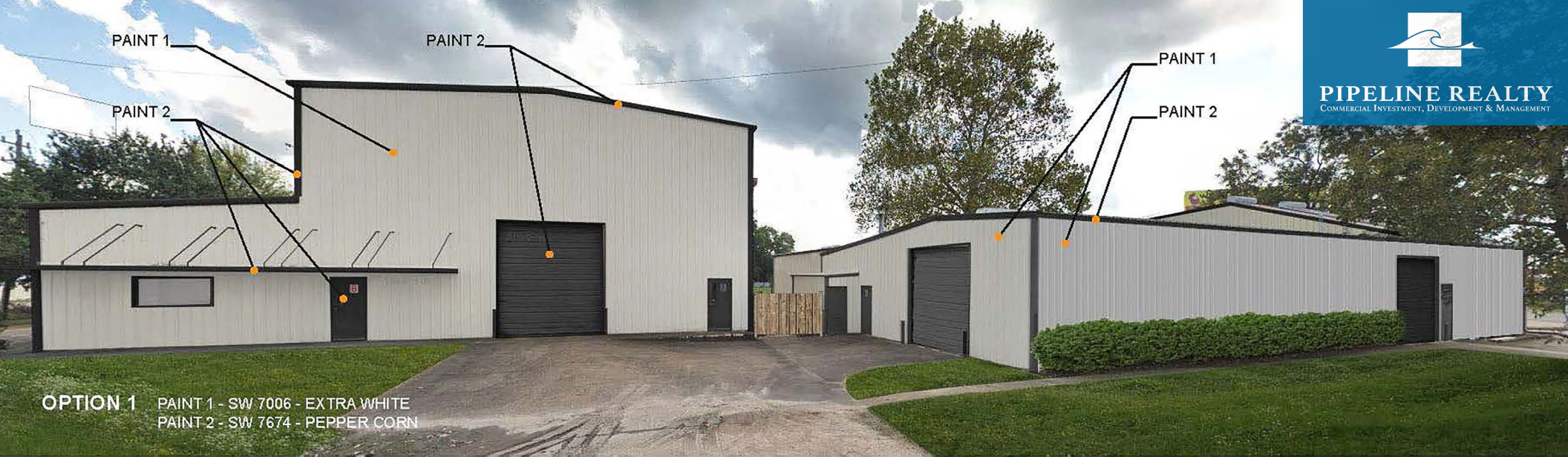
OPTION 1 PAINT 1 - SW 7006 - EXTRA WHITE PAINT 2 - SW 7674 - PEPPER CORN

PIPELINE REALTY COMMERCIAL INVESTMENT, DEVELOPMENT & MANAGEMENT